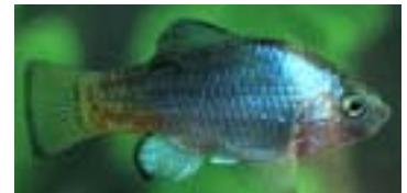
Owens Valley Pufffish