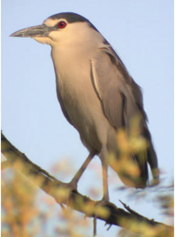
Black-crowned Night Heron

400+ bird species, 100+ breeding species, 124,000 shorebirds, 30,000 Cattle Egret in a single nesting colony, 25,000+ Snow & Ross' Geese, 45% of all Yuma Clapper Rails! But plans are underway to reduce the size of the Salton Sea by approximately half. This has many ramifications, for the birds using the Sea itself and for those using other habitats that make up the ecosystem.