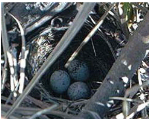
Song Sparrow eggs

There’s been a theory that conspecific parasitism is more common in precocial birds, such as ducks, whose newly-hatched young follow the parents and feed themselves rather than needing the intensive in-nest care of altricial birds. Why? “It doesn’t cost as much for a parent to raise them, so there’s less reason for the parasitized bird to reject them. So a parent would benefit more by parasitising. If you have your own nest and it gets depredated, you still have some eggs in other nests and they have a good chance of surviving. Ducks are going to have problems with incubation but not with decreased ability to feed all the chicks once they’re hatched.”