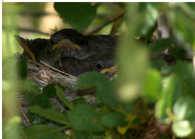
Willow Flycatcher nestlings surrounded by Wood's rose