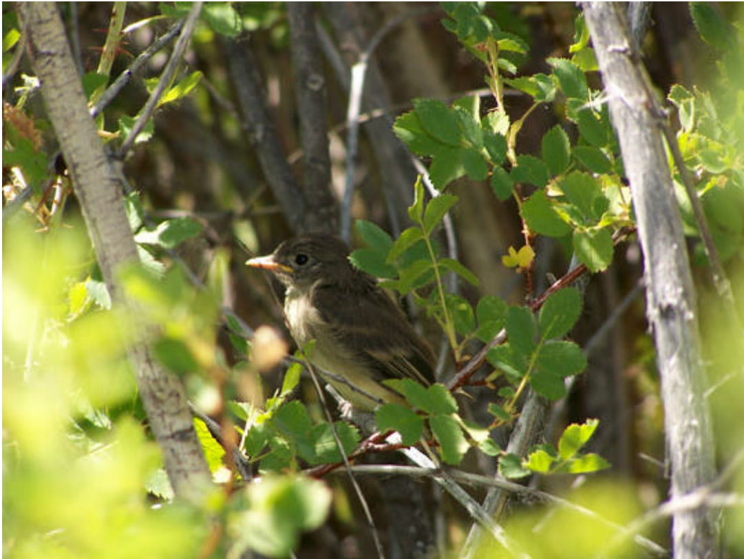
Willow Flycatcher on its fledge day – last fledgling of the last nest of 2006. Chris McCreedy