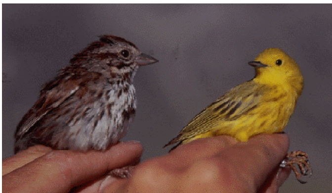
Song Sparrow and Yellow Warbler

Three years into his field work, Quresh’s focus is on learning why Yellow Warbler nests in the Mono Basin are twice as likely to succeed if they’re in Wood’s rose, the common local wild rose, instead of willow or some other shrub. Placing artificial nests – with one finch egg and one clay egg – in both willow and rose, he’s already learned that predators are less likely to rob a nest in rose even with no birds to defend – or reveal – it. “By taking away the effect of parents and nestlings,” Quresh says, “this is showing that it’s definitely predators that are cueing into the nest itself.” Bite marks in the clay eggs tell him that rodents are a major egg predator; when he analyzes the bite mark data he may find out which predators are least likely to take eggs from a nest in rose. He’s also found that artificial nests placed where real nests have already been robbed are more likely to be visited by a predator than those he places where nests have succeeded. “It lends credibility to using the artificial nests, seeing if they’re approximating what goes on with the real nests. I’m getting more information on how the rose is affecting nest predation, and testing the value of artificial nests.”