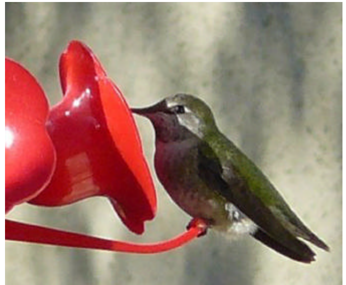
Anna's Hummingbird Chris Howard

The Bishop CBC was held on 15 Dec 2007, a beautiful and clear day with hardly a breath of wind, a high of 48F and a low of 16F. Forty-one intrepid birders scoured as much of the 15 mile diameter count circle as they could. The total number of species was 101, down from the record high of 114 set last year, but still quite respectably over the 100 mark. Highlights this year were a female Hooded Merganser at the Bishop City Park pond, 6 Chukar at Pleasant Valley Reservoir, 3 Bald Eagles in Round Valley and Pleasant Valley Reservoir, 3 Rough-legged Hawks , 2 Ring-billed Gulls at the City Park, 1 Anna's Hummingbird at a downtown Bishop feeder, 186 Mountain Chickadees , 3 White-breasted Nuthatches , 8 Western Bluebirds (golf course and W Line St), 1 Townsend's Solitaire , 2 Lark Sparrows (golf course and intersection: Line St and Reata Rd), and 2 Golden-crowned Sparrows .