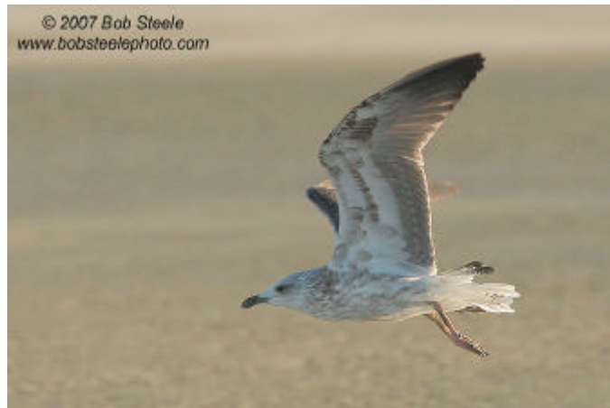
Lesser Black-backed Gull

species breeds in Siberia and winters in the Old World from Africa, through southern Asia to Australia. It has been seen in California about 36 times before this sighting; most records are along the coast, usually in fall, while the few interior records are usually in spring. This sighting is unofficial until accepted by the CBRC.