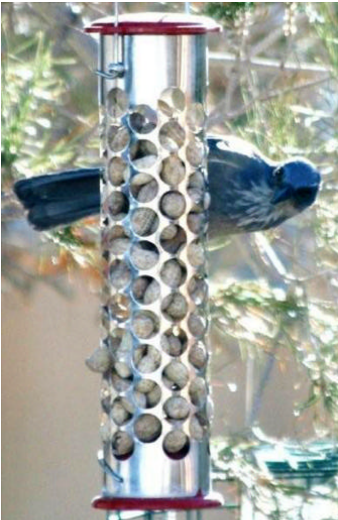
Western Scrub-jay at Mustang Mesa Debby Parker

The Bishop CBC was held on 15 Dec 2007, a beautiful and clear day with hardly a breath of wind, a high of 48F and a low of 16F. Forty-one intrepid birders scoured as much of the 15 mile diameter count circle as they could. The total number of species was 101, down from the record high of 114 set last year, but still quite respectably over the 100 mark. Highlights this year were a female Hooded Merganser at the Bishop City Park pond, 6 Chukar at Pleasant Valley Reservoir, 3 Bald Eagles in Round Valley and Pleasant Valley Reservoir, 3 Rough-legged Hawks , 2 Ring-billed Gulls at the City Park, 1 Anna's Hummingbird at a downtown Bishop feeder, 186 Mountain Chickadees , 3 White-breasted Nuthatches , 8 Western Bluebirds (golf course and W Line St), 1 Townsend's Solitaire , 2 Lark Sparrows (golf course and intersection: Line St and Reata Rd), and 2 Golden-crowned Sparrows .