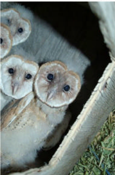
Baby Barn Owls in a nest box at Eastern Sierra Wildlife Care

The curious wisdom of the beginner's mind - Inside!