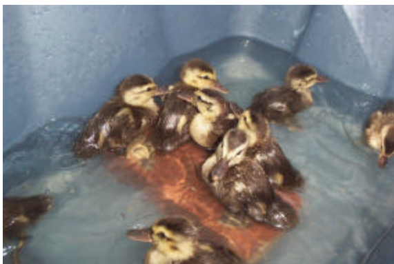
Baby Gadwalls raised and released by Center volunteers. Their mother was killed by a car while leading the newly-hatched youngsters to water.

The Center houses other babies as well as injured adults. Help feed and clean a pair of young American Kestrels or a Great Horned Owl brancher, or swim a brood of tiny orphaned Gadwalls in a tub of warm water. If you're interested, you might foster a ground squirrel or cottontail rabbit.